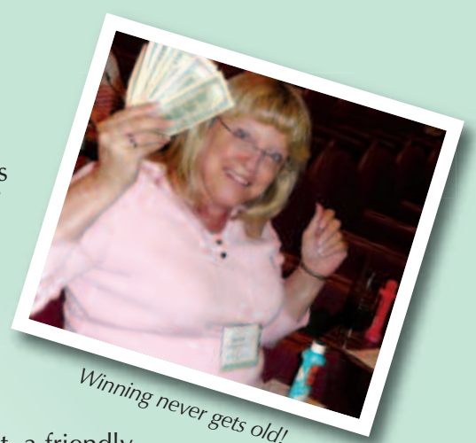
Winning never gets old!

FREE CRUISE – We will be playing the final game for a free cruise for two on the 2013 25th Silver Anniversary Bingo Cruise. All players have a chance to win! In addition, enjoy state-of-the-art equipment, a friendly Bingo staff, plus early-bird bingo and special games.