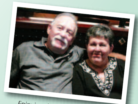
Enjoying the Bingo Players Party

Prizes for Bingo, Slots, Blackjack and Poker may be more or less depending on the total number of players.