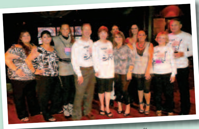
Your Friendly Tournament Staff

Note: To play in the Bingo Tournament you must book through Special Event Cruises and be at least 18 years of age.