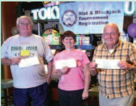
2011 Blackjack Tournament Winners