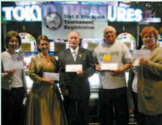
2011 Slot Tournament Winners

The Epic Casino has the widest selection at sea, including the latest slots and video poker machines, Roulette, Blackjack, Craps, Let it Ride®, Texas Hold 'Em, Ultimate Texas Hold 'Em and Three Card Poker.